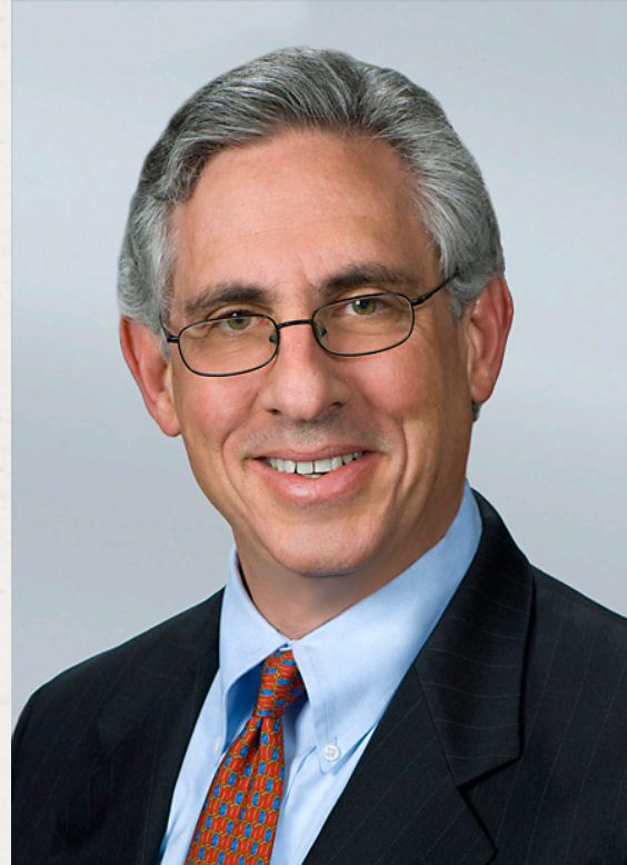
Shumaker, Loop & Kendrick, LLP Toledo, Ohio